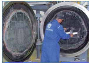
Hassi R'mel Service Center