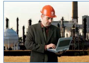
Responsive Field Service and Technical Assistance