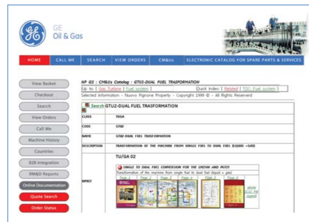
CM&Us detail screen with overview and links to complete reference information