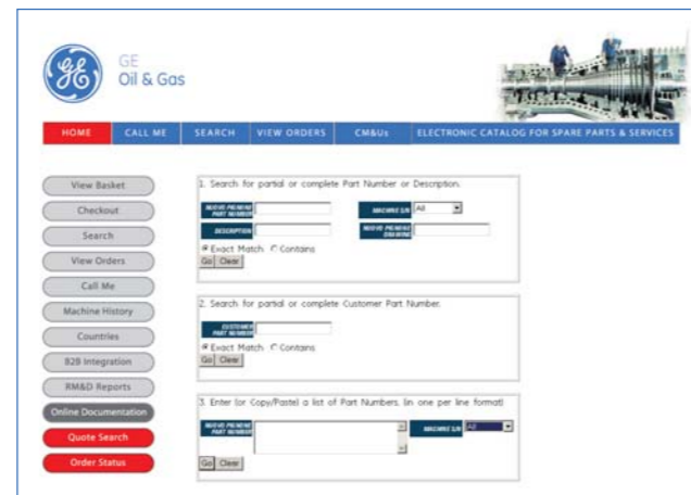
Main search engine with keyword, category and partial/complete product number criteria