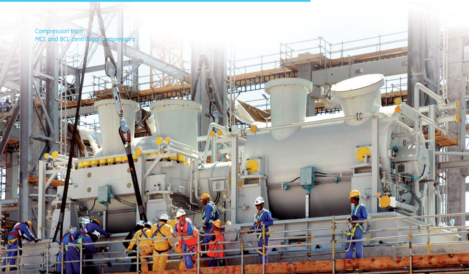
Compression train MCL and BCL centrifugal compressors