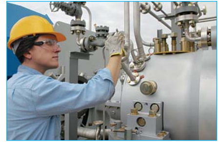
BCL 305C centrifugal compressor