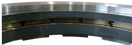
Abradable tertiary seals scheme and stator part

The abradable labyrinth solution is retrofittable with no modification to existing compressor parts. The tertiary contact carbon rings sleeve and housing will be replaced by a toothed sleeve and abradable stator components.