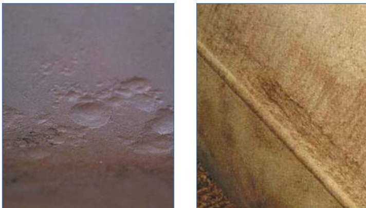
By generating data from magnetic signals on three separate axes, MagneScan Triax is capable of identifying links between individual pitting (left) and NAEC (right).

For more information on MagneScan Triax, contact your GE representative or visit www.ge.com/pii